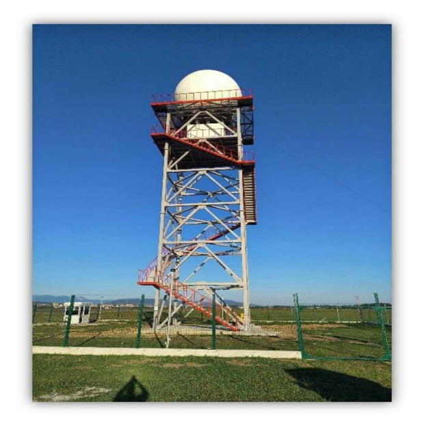
Fig. 1. Appearance of the radar "WRM200" in Kutaisi.

Sigmet" signal processor and IRIS software guarantee high quality radar data that meets even the most stringent dual polarization requirements for the most demanding clients. The state-of-the-art design and high quality fabrication of the antenna and rack also contribute to low maintenance costs throughout the life of the system [9,10]. Appearance of the radar "WRM200" in Kutaisi in fig. 1 is presented.